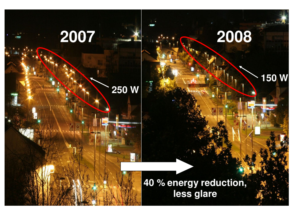
Two photos of Tržaška Road in Ljubljana: The left photo is from year 2007 with old luminaries using 250 W HPS bulbs. To the right is the situation in 2008 showing reconstructed road illumination using 150 W HPS bulbs with fully shielded luminaries, as stipulated by the Decree on the limitation of light pollution of the environment. Energy consumption has decreased by about 40% and emissions over the horizontal are 0%.

We are surprised that your region has decided to halt the success that the law is destined to generate. The benefits of comprehensive and effective light pollution laws to the plant and animal populations and biodiversity in general are scientifically undeniable. No less obvious are the results of such laws in terms of energy savings . Slovenia, having passed on 30 August 2007 a decree similar to that of your region, is witnessing very real cuts in energy consumption. The positive impact can be confirmed by the monitoring activity of our NGO as well as by concrete projects, such as that carried out in the municipality of Šempeter-Vrtojba by the local energy agency GOLEA, demonstrating significant energy reduction (about 50%) while preserving the same lighting levels (please see <a href="http://www.sempeter-vrtojba.si/?vie=gds&id=20081002124027">http://www.sempeter-vrtojba.si/?vie=gds&id=20081002124027</a>).